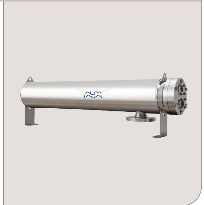
Fig. 1. Double tube sheets prevent cross contamination between the product and the heating/cooling medium.